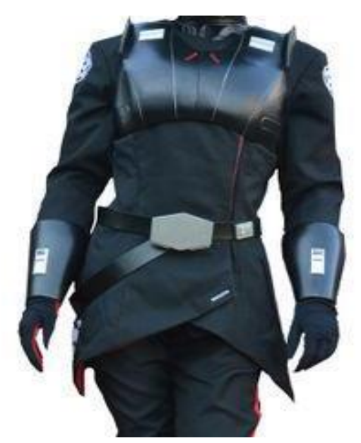
Figure 3. Tunics for Second Sister and Seventh Sister