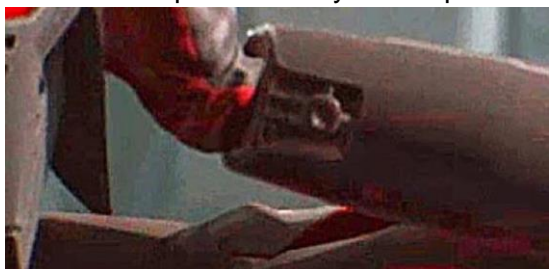
Figure 6. Gauntlet texture example 1

Bracers should be made of an approvable armor material (see Armor section). They should be smooth or lightly textured, and the only addition allowed is a communication device in the style found on either Clone Wars era Jedi or on the Grand Inquisitor. Bracers may optionally have two white stripes in the style of inquisitor bracers from Fallen Order.