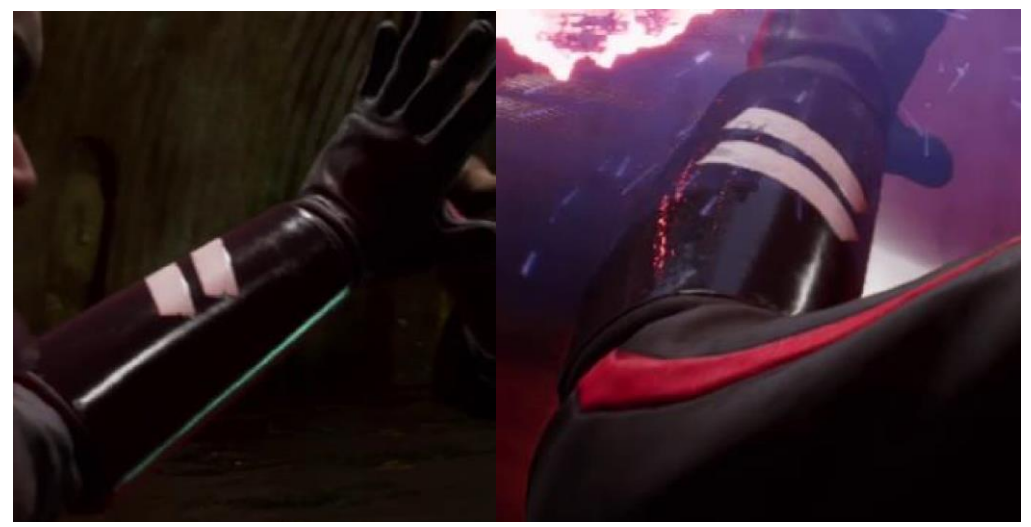
Figure 8. Examples of white stripes on gauntlets