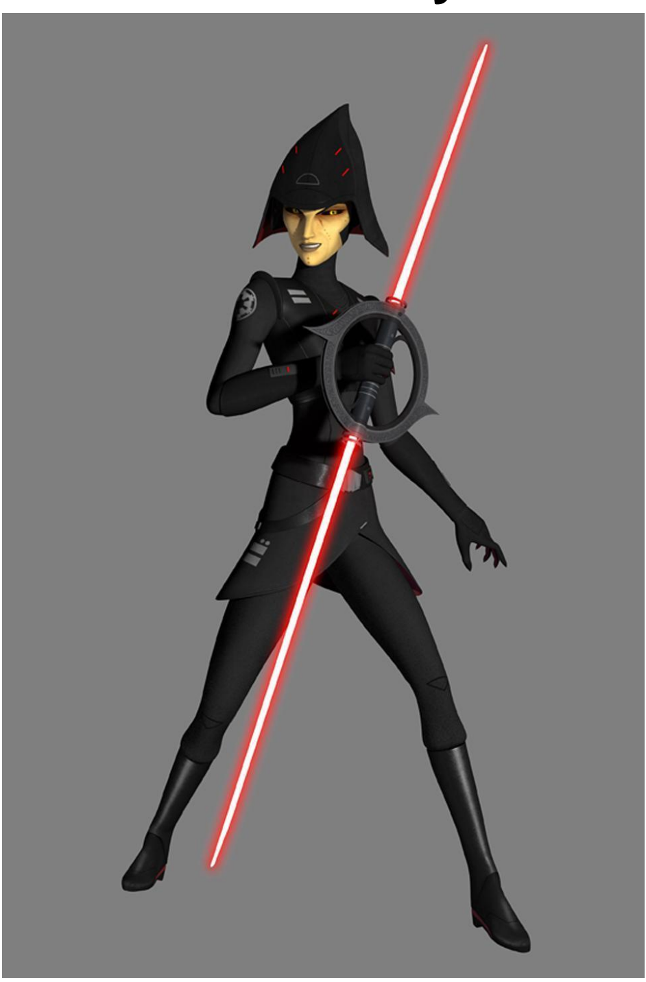
Figure 1. Seventh Sister