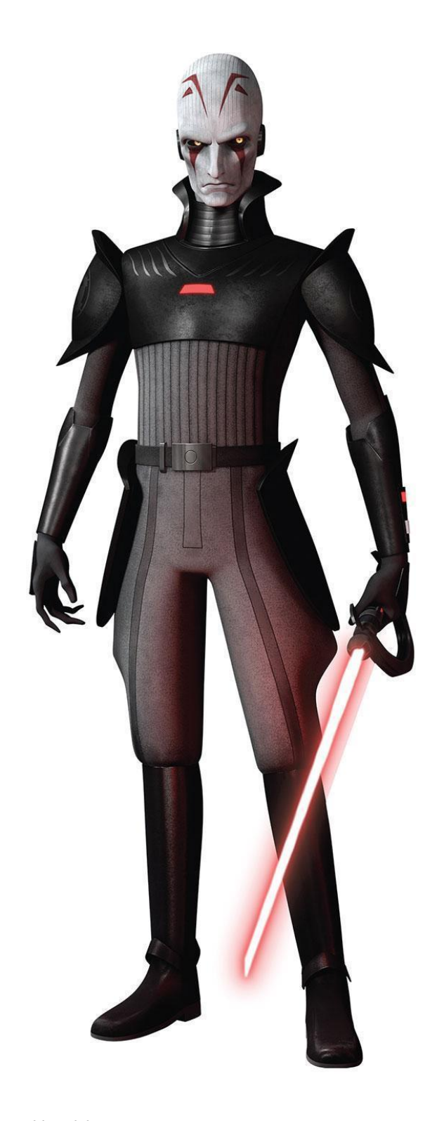
Figure 2. Grand Inquisitor